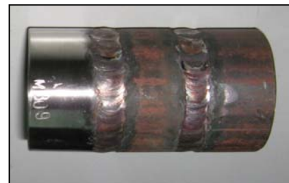
Magna 309's welded sample – Stainless steel to carbon steel to carbon steel