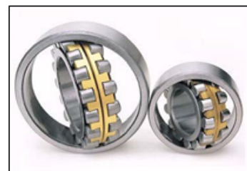
Spherical roller bearing