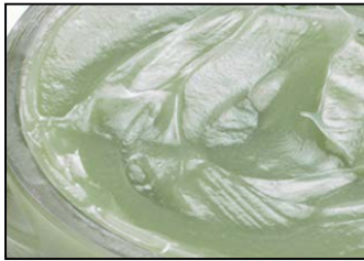
OMEGA 22 showing smooth texture and light green color

According to 4-Ball EP performance test (ASTM Test Method D-2596), the new OMEGA 22 achieves a weld load of 500 kgf, representing a remarkable 40% improvement in the grease’s load carrying capacity!