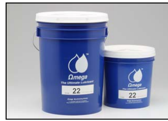
OMEGA 22 is available in 5 kg and 15 kg pack-sizes